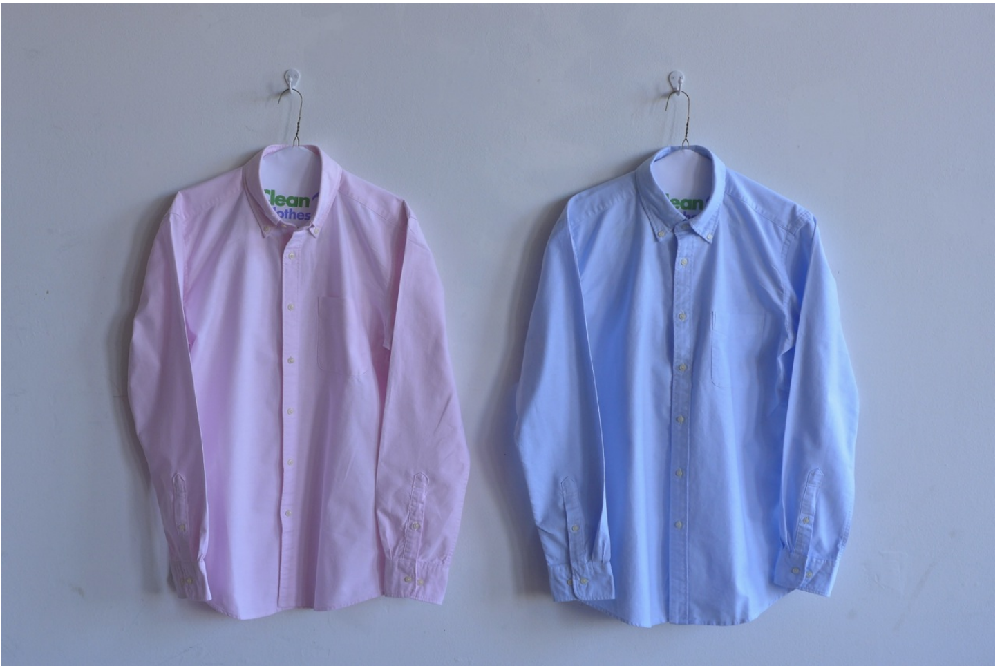
Men's Oxford shirts, wire hangers, paper, coat hooks.