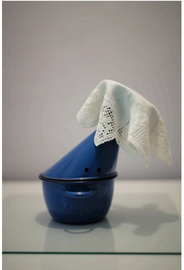
Two vintage French inhalers, lace handkerchief, linen towel, glass, mirror