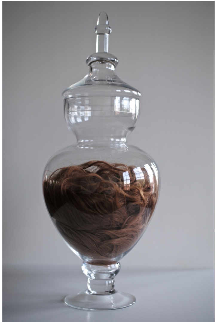
Glass, dried roses, synthetic hair.