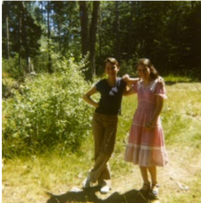
The artist (left) and her best friend at 18 years old.